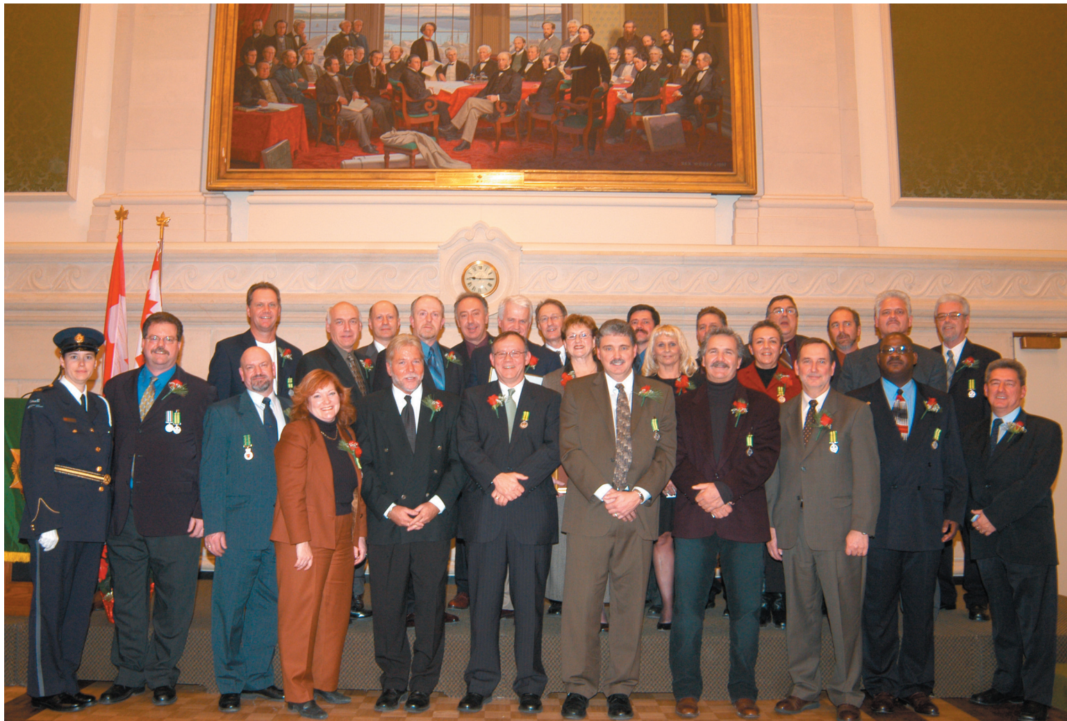
Award winners pose at the front of the Railway Committee Room in Centre Block, Parliament Hill.